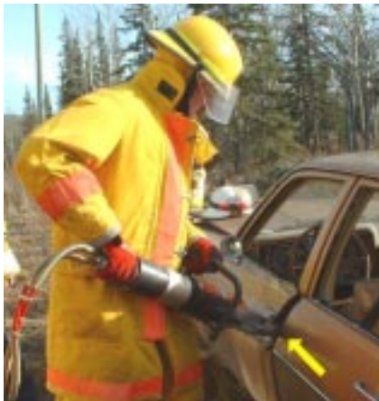
After glass removal, the rescue tool is used to open a door.

Editor-in-Chief's note: I think our MLFR people are pyromaniacs... they're always setting fire to things.