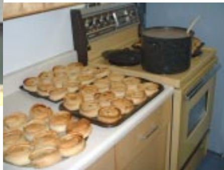
...and those delicious meat pies waiting to be eaten.