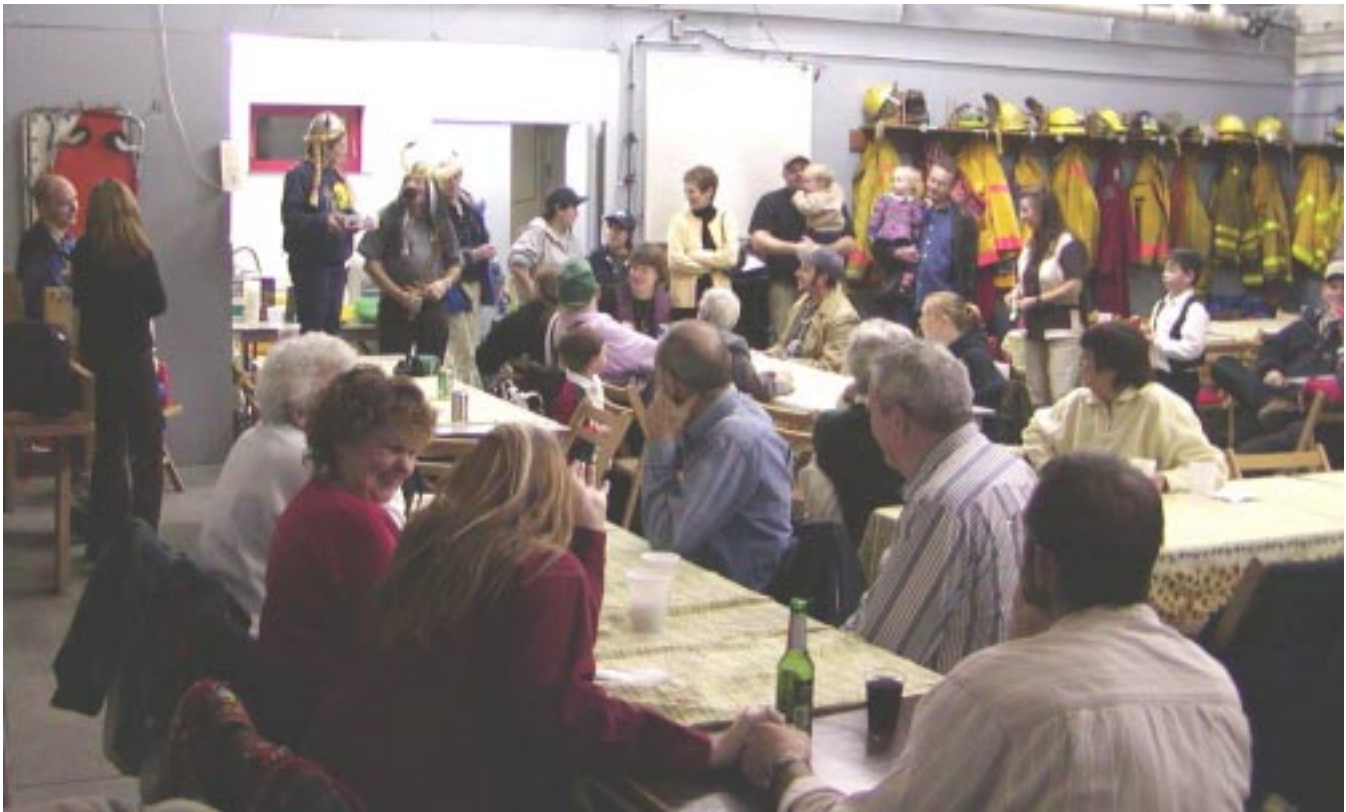
Draw prize time