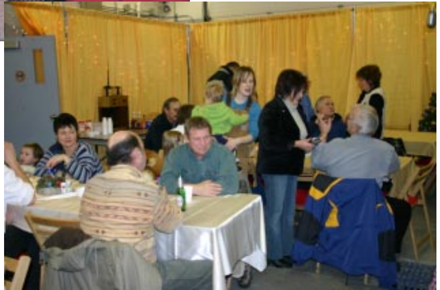
Enjoying conversation with friends and neighbours.